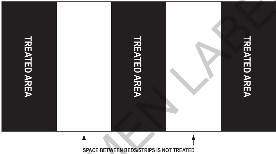
Figure 1. Bedded/Strip Application (1 acre application block)

The "broadcast equivalent rate" must be calculated with the following formula: